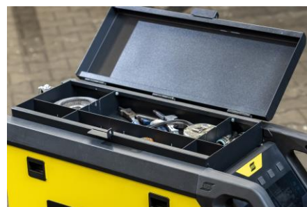
Optional top toolbox for accessories