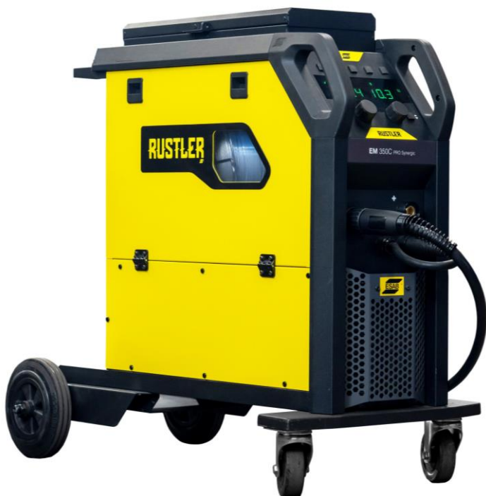
Rustler EM 350C PRO Synergic

Rustler MIG PRO compact welding inverters are your solution of choice for the most common welding challenges. Equipped with the latest inverter technology, they combine low energy consumption with optimized welding performance.