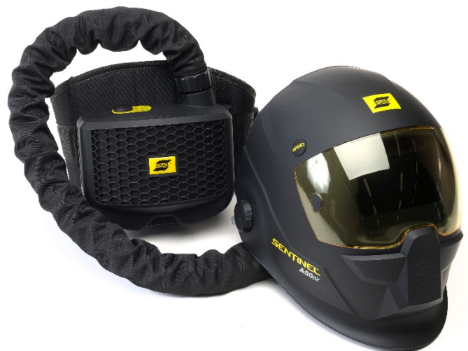
SENTINEL A50 Air with ESAB PAPR unit