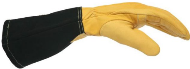
Curved MIG (top) Curved TIG (bottom)

These superior welding gloves from ESAB offer a whole new approach to fit, form and function. Ergonomically designed to fit the natural curve of the hand, offering increased quality & comfort to the wearer.